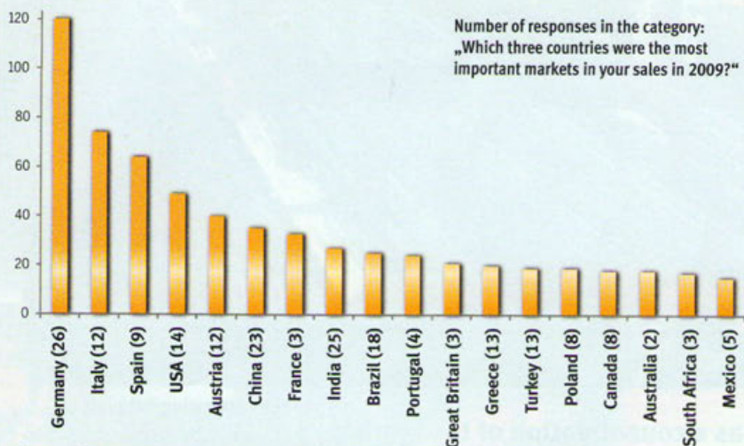
Fig. 1: The most attractive sales markets for the collector industry in 2009 in order of the number of responses. The figures in brackets are the number of manufacturers which have their headquarters in that country. 248 questionnaires were evaluated. Countries with over 15 responses are included. The four countries Germany, Italy, Spain and the USA have defended their peak positions from 2008. France, Great Britain and Mexico have slipped back several places.

as fig. 2 shows. During the boom year of 2008, 13 new entrants were shown on the world map: this year it was just 8 companies. Sun Radiant is not one of them. The Italian company postponed its entry planned for the summer of 2010 due to the low general demand: „We are continuing to buy in collectors and are still deciding whether to start with our own production next year,” explains company head Goran Zeponi. The new entrants on the world map come from Azerbaijan, Austria, the USA, Macedonia,